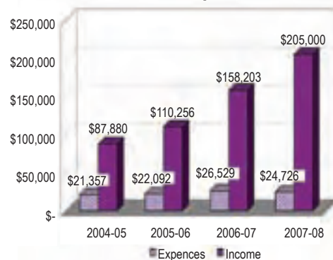
Income & Expenses